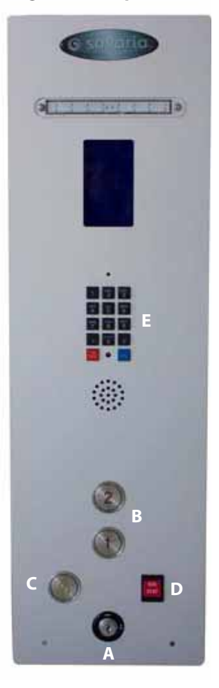
Figure 1: Sample COP

This button can be used at any time to stop the cab and activate the alarm buzzer.