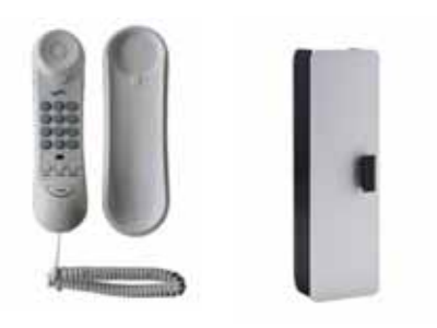
Figure 2: Standard Phone and Phone Box

If the unit has a standard phone, it is located in the cab phone box (see below).