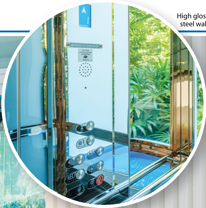
High gloss stainless steel wall and COP