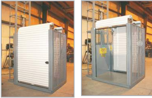
Roll up doors