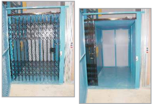
Freight style folding gates

All our cabs can incorporate electrically interlocked gates and doors exceeding the Requirement of ANSI/ASME B20.1